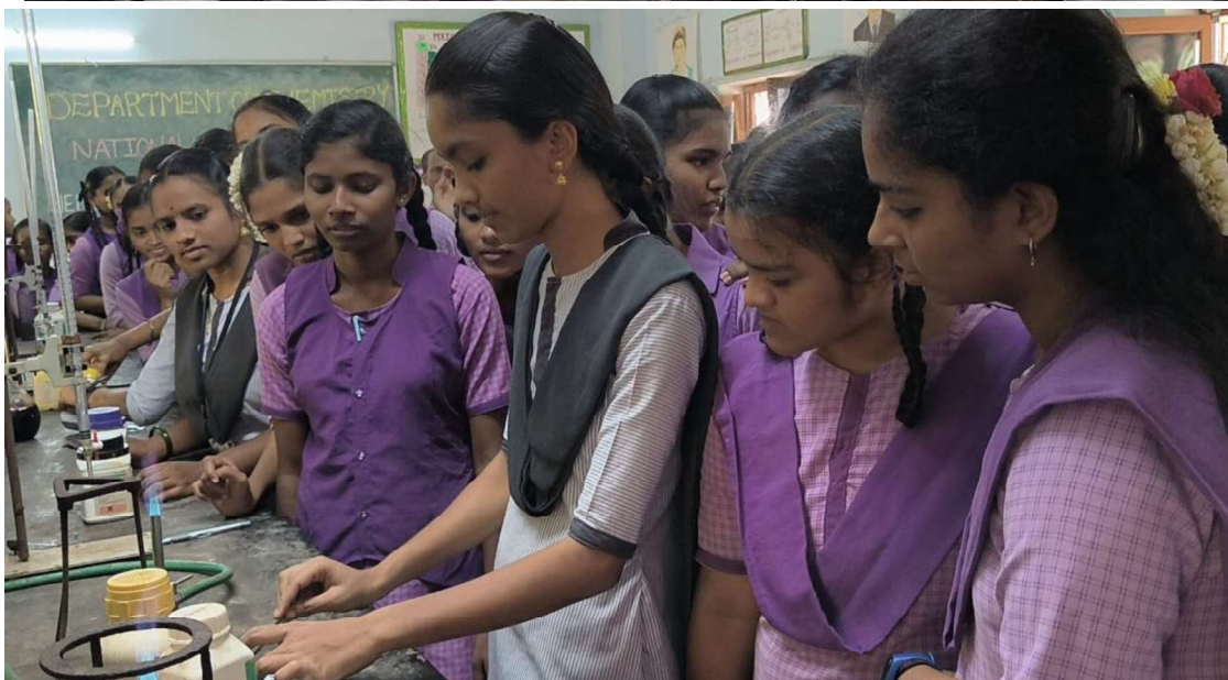
I B.Sc and II B.Sc Hons Chemistry students are explaining the characteristic's flame colour of simple inorganic salt and discussed about various laboratory equipment's.